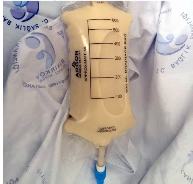
Figure 3. Milky colored chylous fluid in the drainage bag.

Various algorithms are presented in the literature for management of CA, but there is no consensus (8, 10). The first step of treatment is the conservative ap-