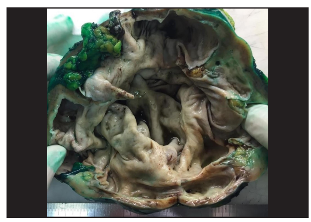
Figure 1. Gross appearance of the kidney