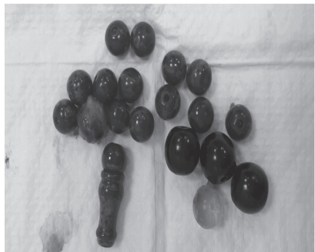
Figure 3: Nineteen prayer beads removed from the patient