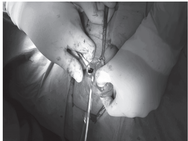
Figure 2: Intraoperative image of the beads