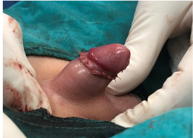
Figure 2. Appearance of the penis in figure 1 after surgical revision

In the four patients who developed Grade 5 phimosis after scalpel circumcision, steroid treatment did not elicit any response (0%), so surgical revision was performed. In the eight cases of Grade 4 phimosis, four responded (50%) to steroid treatment. After treatment, one of these (25%) cases improved to Grade 0, and three cases (75%) to Grade 1. Surgical revision was performed for four patients (50%) who did not improve. Six of the eight (75%) patients with Grade 3 phimosis treated with topical steroid application improved to Grade 0 after six weeks of therapy. In two of these (25%) patients whose phimosis improved to Grade 2, treatment was prolonged for an additional two weeks. At a control visit one month later, their phimosis has worsened to Grade 3, which required surgical intervention. Steroid-related side effects were not observed in any case.