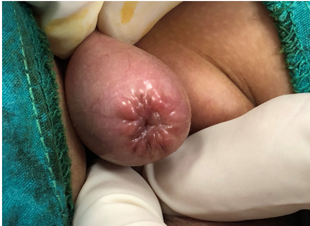
Figure 1. Grade 5 phimosis developed following thermocautery circumcision